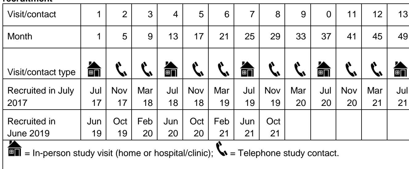
Table 3 Example visit/contact schedule for patients recruited in first and last month of recruitment

The study visits/contacts of two example patients, one recruited in the first month of recruitment and one recruited in the last month of recruitment, are set out in Table.