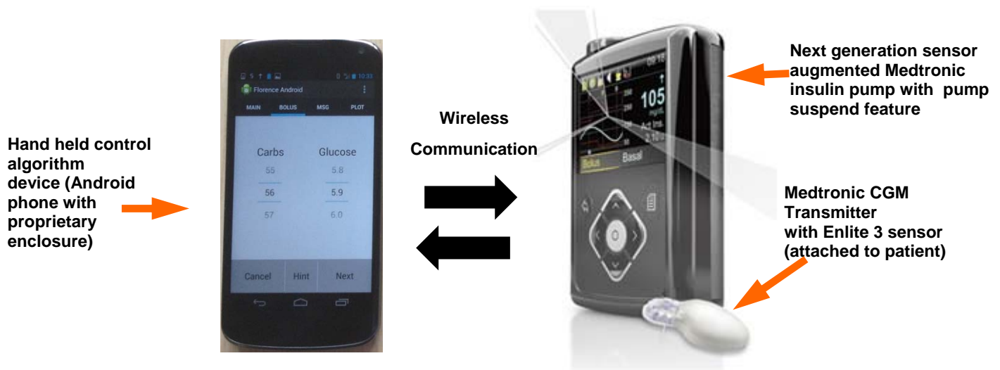
Figure 1: Representative design of the proposed FlorenceM automated closed loop system

An overview of this proposed automated closed loop system is given in Figure 1.