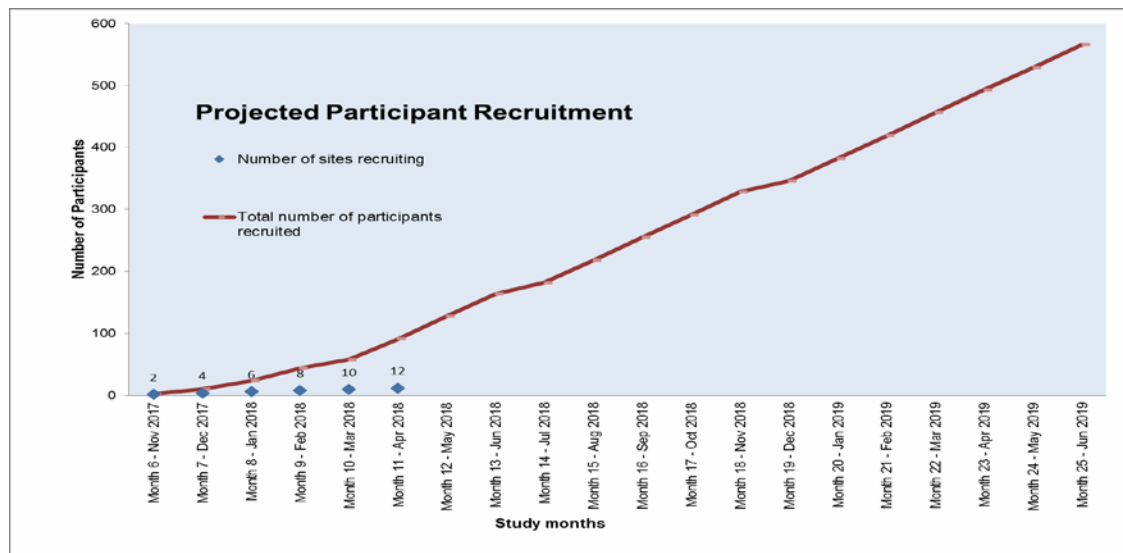
Figure 1 – Recruitment projections

Pilot study data and literature review has suggested that at a conservative estimate approximately a third of patients will suffer from delayed return of gut function in an estimated 90 to 250 cancer resections per unit per year (National Bowel Cancer Audit Project 2015). Our Targinact study(4) showed that patient interest and participation was high (only 2 out of 82 patients declined to participate, 62 randomised of 82 approached). Therefore we would expect that with 12 centres open and 11 of these recruiting 3.3 participants per month per centre (36 to 37 in total per month) we would expect to achieve our target of 562 participants over a 20 month recruitment period. The 20 month recruitment period allows for a staggered site set up, lower recruitment during peak holiday times (Christmas and summer) and in the first month of site set up. The projected recruitment is modelled below in Figure 1.