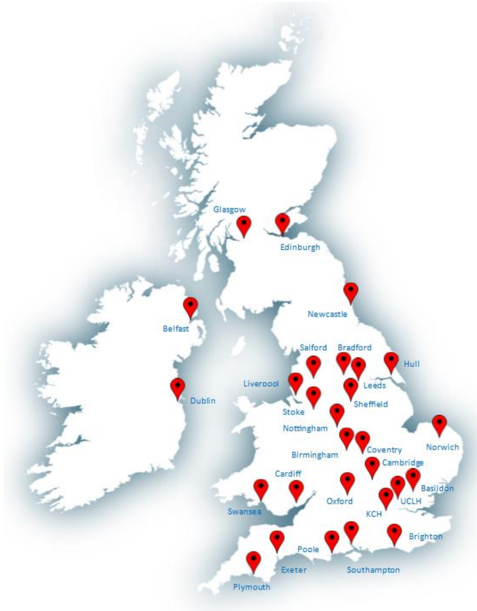
Figure 2: Map of expected MS-STAT2 sites

Ongoing monitoring of recruitment against set milestones will provide a crucial opportunity to review issues relating to number of sites open and randomisation targets at each recruiting site. More importantly, it will provide the possibility of adopting strategies to maintain and increase patient recruitment across sites. Recruitment will be managed and reviewed by the MS-STAT2 Recruitment Management Group.