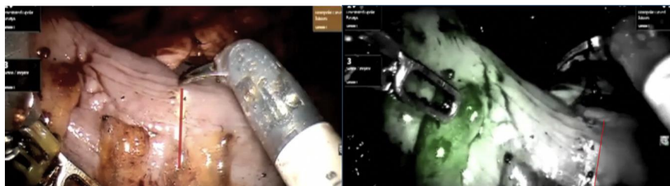
Figure 1: Left: the colon transection point (red line) appears well-perfused under white light laparoscopy. Right: poor bowel perfusion at the transection point under ICG-NIR laparoscopy (lack of green fluorescence), resulting in an ischaemic anastomosis.

early results. The technique involves intravenous administration of Indocyanine Green (ICG), which rapidly binds to plasma proteins and stays in the intravascular compartment. When irradiated with near-infrared light through an operating laparoscope, ICG fluorescence can be visualized on a standard visual display unit providing an image of tissue perfusion. Figure 1 illustrates the use of ICG-NIR angiography in selecting well-perfused bowel for anastomotic construction, and clearly demonstrates the possible advantage over white light assessment.