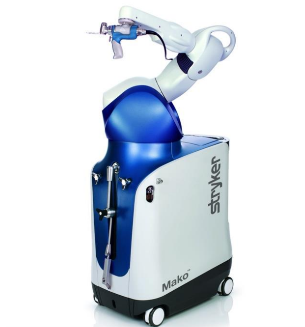
Figure 1: The MAKO robot. The surgeon moves it into the surgical field, the robot controls the cuts

Robotic-arm systems resolve the problems of earlier computer devices by constraining the surgeon in such a way that they can only deliver the bone cuts according to a pre-planned three-dimensional template (figure 1). Much greater precision can be achieved than with standard instruments, especially in obese people, where conventional surgery is more challenging.(16) Subtle adjustments to the position of the implant can be planned and delivered in theatre by making small corrections to the software, which cannot be delivered consistently using conventional jigs or older computer systems, due to the risk of error.