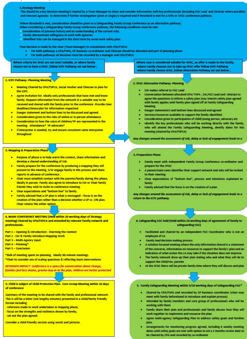
Figure 2: Partner LAs ICPC/FGC Alternative Pathway

This pathway sets out the process when considering families for ICPC/SFGC alternative pathway. All Child Protection investigations and assessment to be completed within 45 days.