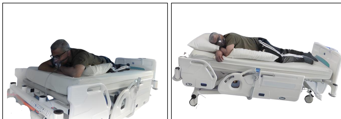
Figure 2: Images of full-prone and 3/4 prone position

We carefully considered the optimum daily target for awake prone positioning, noting that in observational studies a treatment duration of 6-8 hours/ day seems to be a key cut-off for treatment efficacy. 25 26 However, the recent systematic review and meta-analysis of awake prone positioning in COVID-19 found no evidence of an interaction in a sub-group analysis of treatment duration. 24 The large meta-trial of awake prone positioning in COVID-